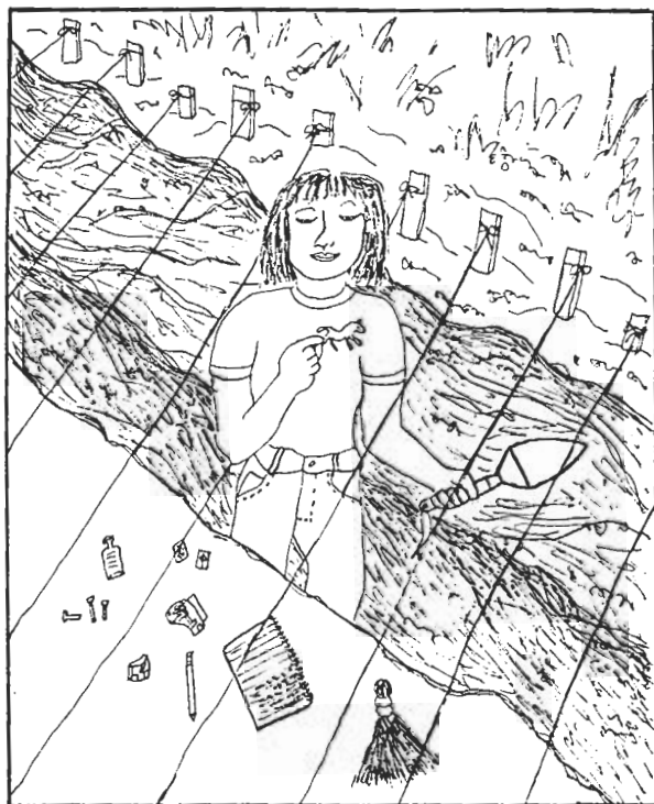
First phase of the Chinatown excavation.

Last November, in the first phase of the dig, the committee began salvaging as much as possible from the designated one-acre parking lot area of the site. It was discovered that the area was mainly used as a vegetable garden and a wealth of material was uncovered in what turned out to be a village garbage dump. Some of the items included pottery shards, animal bones, opium pipes, square-headed nails, herbal bottles, gaming pieces, kitchen tiles, and a pewter horse.